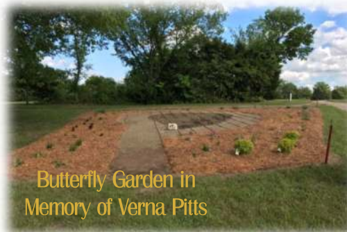
Butterfly Garden in Memory of Verna Pitts