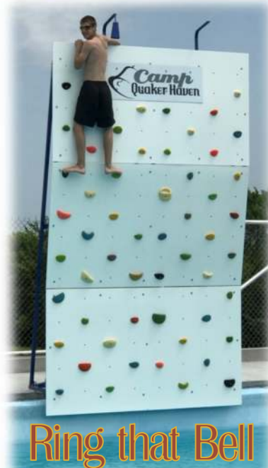
Ring that Bell