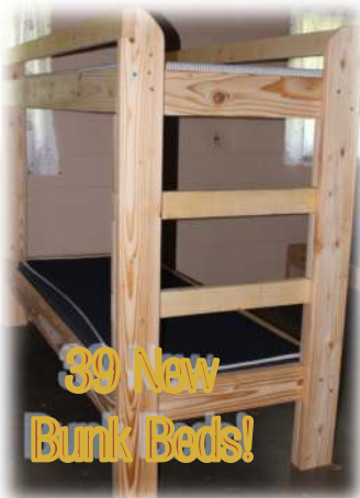
39 New Bunk Beds!