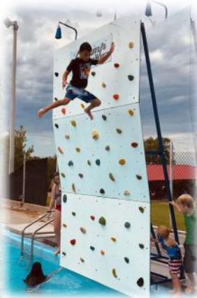
2019 Family Camp Photos